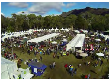
Grampians Grape Escape Halls Gap Oval